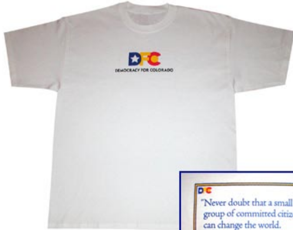
DFC Logo & Quote T-shirt Quote on back of T-shirt enlarged slightly for readability

These 100% cotton T-shirts are our thank you gift for mailed-in donations of $100 or more. You may also purchase T-shirts for $20 apiece, including postage. Sizes and quantities are limited.