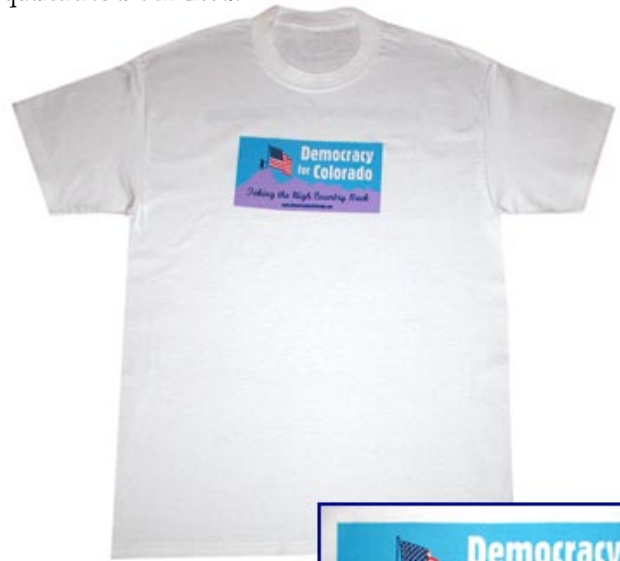
Vintage DFC T-shirt Image on front of T-shirt enlarged slightly for readability